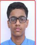
KABIR 90.6 %