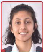
IRA 94.8 %