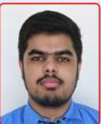
KUSH 91.4 %