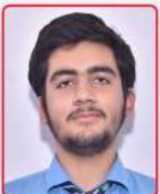
MANAN 90.8 %