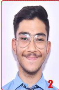
YAJUR 97 % (COMMERCE)