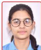
MANVI 93.6 %