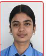
SURUCHI 93.6 % (PAINTING=98)