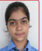
SALONI 90.4 %