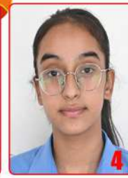
NIYATI 96.2 % (COMMERCE) (ACC.=100, PHE=99)