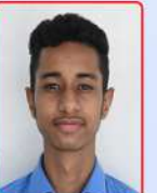
SAMARTH 90.2 %