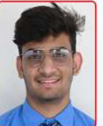
MADHAV 92.8 %