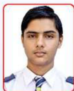
SAGAR 94.4 % (IP=98)