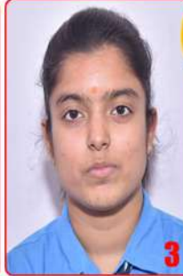
SONAL 96.6 % (COMMERCE) (ACC.=100, MATHS=98)