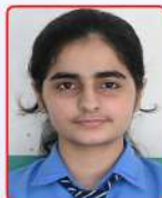
MEHAK 94.6 %