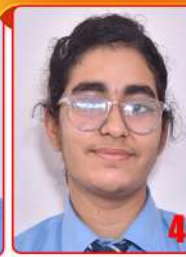
NISHKA 96.2 % (SCIENCE) (CHEM.=97)