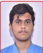
ADAMYIA 90.8 %