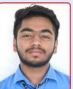
SAHAJ 92.2 %